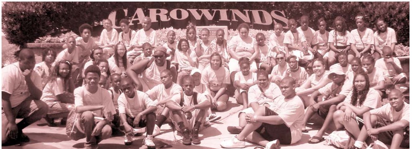
CYF Conferees at the entrance to Carowinds on Wednesday, June 22, 2011